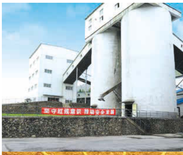
Processing Plant, Maogong Mine

In 2016, Maogong Mine was engaged in both open-pit mining and underground mining. For open-pit mining, efforts were made to ensure accomplishment of the open-pit output plan by accelerating stripping progress and optimizing pit shell. For underground mining, the mine made it possible for large-scale production by speeding up the safety production inspection and acceptance procedures for the phase one project of the