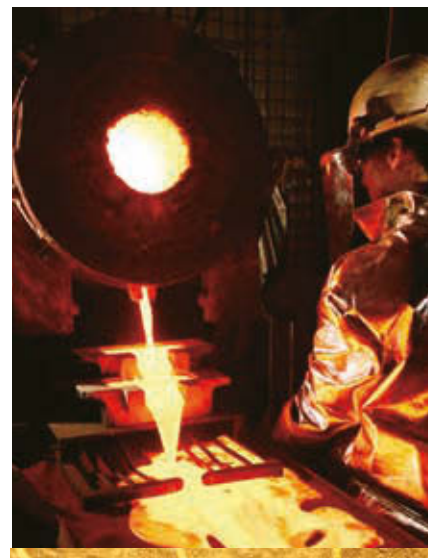
Gold Dore Pouring

In 2016, production costs were significantly reduced and production efficiency was also improved in our iron ore business through technology improvements and optimization of production systems. Of which, the output of iron ore concentrates from Maogong Mine, the key low-cost mine of the Group, recorded a significant increase of 30.35%, leading to dramatic decrease in average production cost of iron ore concentrates and significant increase in the profit margin of iron ore concentrates. In 2016, the average cash operation costs of iron ore concentrates decreased to RMB260/metric ton (2015: RMB317/metric ton), representing a year-on-year decrease of 18.00%.