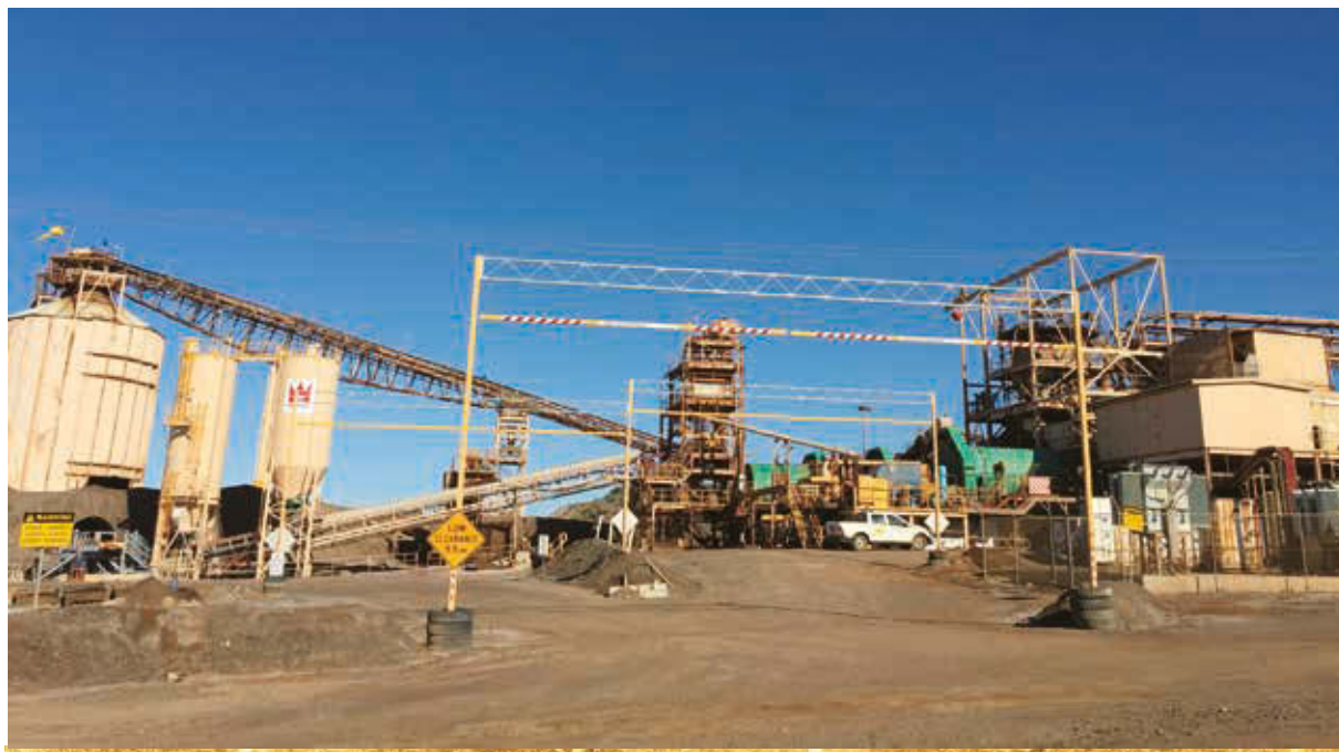
Marvel Loch Processing Plant

In 2016, the oxide ores from the Axehandle Gold Mine resulted in increased pulp concentration in the leaching tank. The thickening of ore pulp reduced the liquidity of the activated carbon in the gold absorption and recovery process, thus lowered the processing capacity and recovery rate of the ores. Through numerous experiments, Marvel Loch Processing Plant found the best blending ratio between the primary ores from Nevorio Gold Mine and the oxide ores from the Axehandle Gold Mine, and removed the viscous minerals from the oxide ores using portable sieving equipment, so as to effectively solve production problems and accomplish the expected production plan. As of 31 December 2016, the Processing Plant processed a total of 1,757,935 metric tons (2015: 993,360 metric tons) of ores with a recovery rate of 91% (2015: 90%), producing a total of 121,456 ounces (2015: 58,887 ounces) of gold, which represented a year-on-year increase of 106%, at the mining cost of AUD26.54/metric ton of ores (2015: AUD24.18/metric ton of ores).