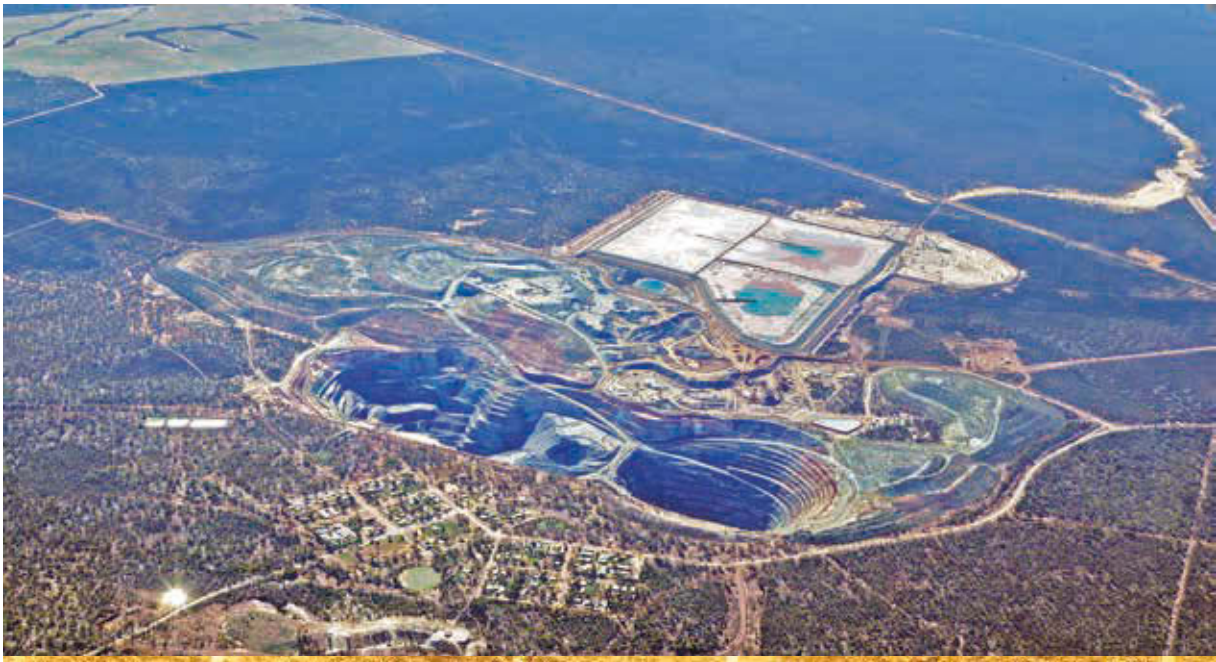
Marvel Loch Gold Project