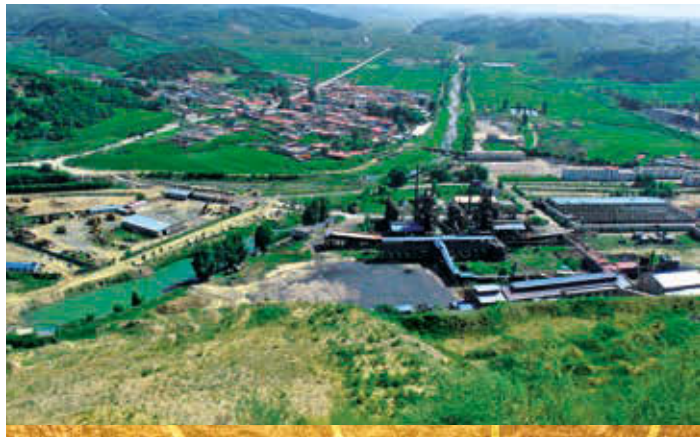
Processing Plant, Aoniu Mine

Aoniu Mine has two processing plants. In 2016, the processing workshop launched the equipment maintenance plan and equipment inspection system, so as to ensure smooth operation of all equipment. The average grade of iron ore concentrates produced in 2016 was 69.49%. Efforts were made to improve product quality and strengthen cost control, so as to better meet the market needs.