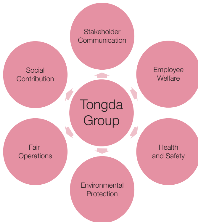
Tongda Group's CSR Model

The ESG Report spans for the period from 1 January 2016 to 31 December 2016, and covers information of the Group – Hong Kong headquarters and its production bases in China, such as Shishi (石獅), Xiamen (廈門), Changshu (常熟), Shenzhen Baoan (深圳寶安), Shenzhen Shajin (深圳沙井), Nanan (南安) and its research and development centres in Taiwan, Kaohsiung (台灣高雄) and Shanghai (上海). The ESG Report provides detailed explanation with regard to the Group’s CSR model, shown in below, on different aspects, including working environment quality, employee welfare and training, health and safety, environmental protection, operating practices, community involvement and stakeholder communication. Throughout the ESG Report, the term “Group” refers to Tongda Group Holdings Limited and its subsidiaries, unless otherwise stated.