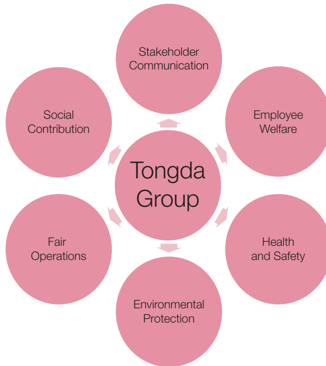
Tongda Group's CSR Model

The ESG Report spans for the period from 1 January 2017 to 31 December 2017, and covers information of the Group – Hong Kong headquarters and its production bases in China, such as Shishi (石獅), Xiamen (廈門), Changshu (常熟), Shenzhen Baoan (深圳寶安), Shenzhen Shajin (深圳沙井), Nanan (南安) and Shanghai (上海). The ESG Report provides detailed explanation with regard to the Group’s CSR model, shown in below, on different aspects, including working environment quality, employee welfare and training, health and safety, environmental protection, operating practices, community involvement and stakeholder communication. Throughout the ESG Report, the term “Group” refers to Tongda Group Holdings Limited and its subsidiaries, unless otherwise stated.