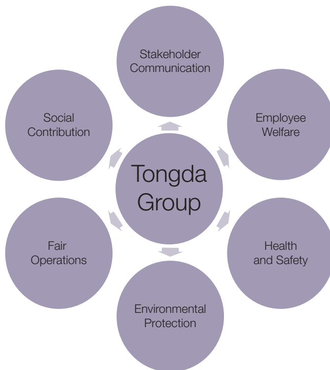
Tongda Group’s CSR Model

The ESG Report spans for the period from 1 January 2018 to 31 December 2018, and covers information of the Group – Hong Kong headquarters and its production bases in China, such as Shishi (石獅), Xiamen (廈門), Shenzhen Baoan (深圳寶安), Shenzhen Shajin (深圳沙井), Nanan (南安) and Shanghai (上海). The ESG Report provides detailed explanation with regard to the Group’s CSR model, shown in below, on different aspects, including working environment quality, employee welfare and training, health and safety, environmental protection, operating practices, community involvement and stakeholder communication. Throughout the ESG Report, the term “Group” refers to Tongda Group Holdings Limited and its subsidiaries, unless otherwise stated.